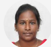
T.IMMACULATE YONICA II BCom PA